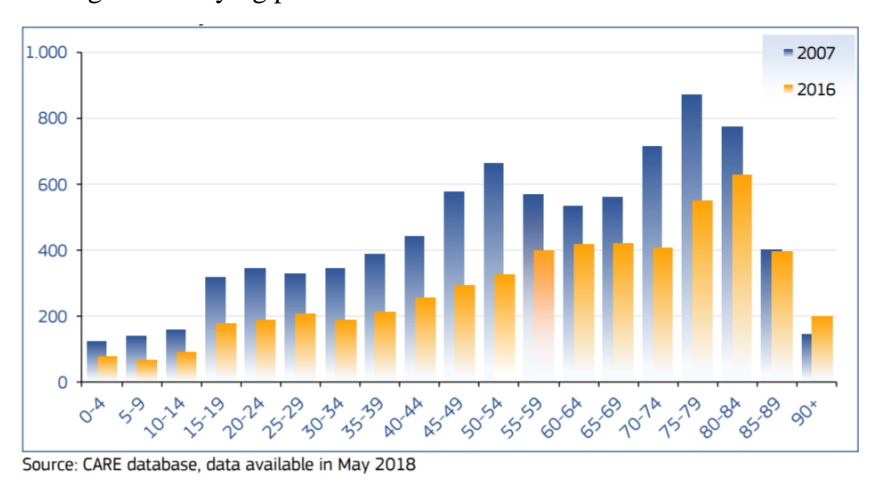
Figure 1. Number of Pedestrian Fatalities by Age Group, EU, 2007 and 2016

Although a high percentage of child (0-14) fatalities were pedestrians, they only represent 4% of total pedestrian fatalities, in European Union. Unlike the European Union average, the percentage in Romania is higher - 6%, which shows us that the worse road education among children can be a quite important factor when it comes to combating this worrying phenomenon.