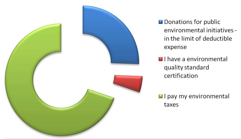
Figure 1 Answers for question 1: "Among the following actions, the most important are..."

The first question was focused on how the enterprise involves itself in environmental responsible actions. The purpose of this question was to evaluate the knowledge in the field of environmental responsibility.