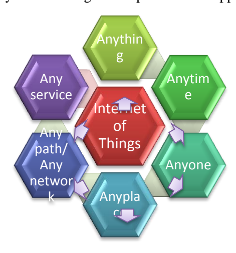
Figure 1. Definition of the IoT Source: (Vermesan et al., 2011; Perera et al., 2014)

Beyond these different approaches, one of the most popular definitions is that given by Vermesan et al. (2011), who stated that the IoT "allows people and things to be connected Anytime, Anyplace, with Anything and Anyone, ideally using Any path/network and Any service". Figure 2 represents this approach.