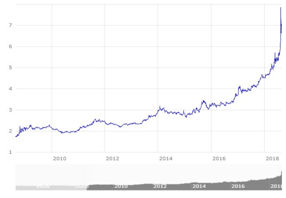
Figure 2. ECB Euro Reference Exchange Rate: Turkish Lira (TRY) (August 2008-August 2018)

In addition to this, the value of Turkish lira depreciated rapidly against dollar, euro, pound and other currencies in very recent time; and considering the EU countries, 1\epsilon was below 2\epsilon in 2008, and the highest value of 1\epsilon was recorded as more than 8\epsilon in August 2018, which means more than 300% increase within 10 years, hence ricocheting the purchasing power of EU citizens in Turkey, despite considerable inflation in price levels, and consecutive tax additions for certain products such as alcoholic beverages, cigarettes, and so forth. The unstoppable devaluation of Turkish lira can be seen in Figure 2.