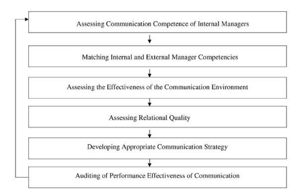
Figure 2. A manager's guide to establish better communication in intercultural settings

As we mentioned glass-ceiling for women in gender part of this chapter, it stands for minorities, as well.