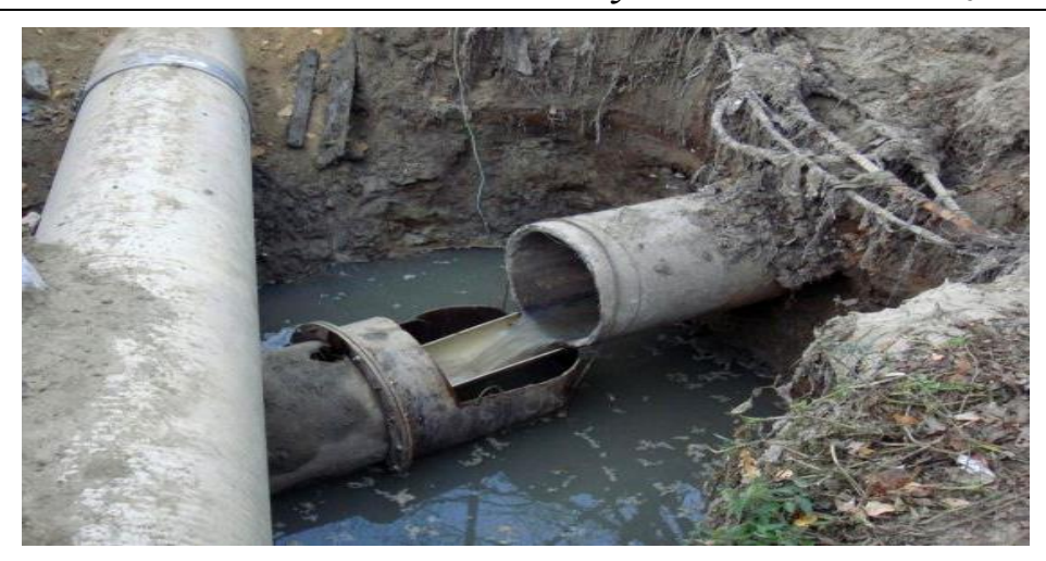
Figure 1. The sewerage collector from the "Propeller area" 1

The study and expertise drawn up in 2012, with regard to the area at the "Propellers" and the area of blocks of flats P, has included both samples and measurements to the ground, and comments from satellite which have highlighted the displacement of soil in the area to a level of 10 mm in one month.