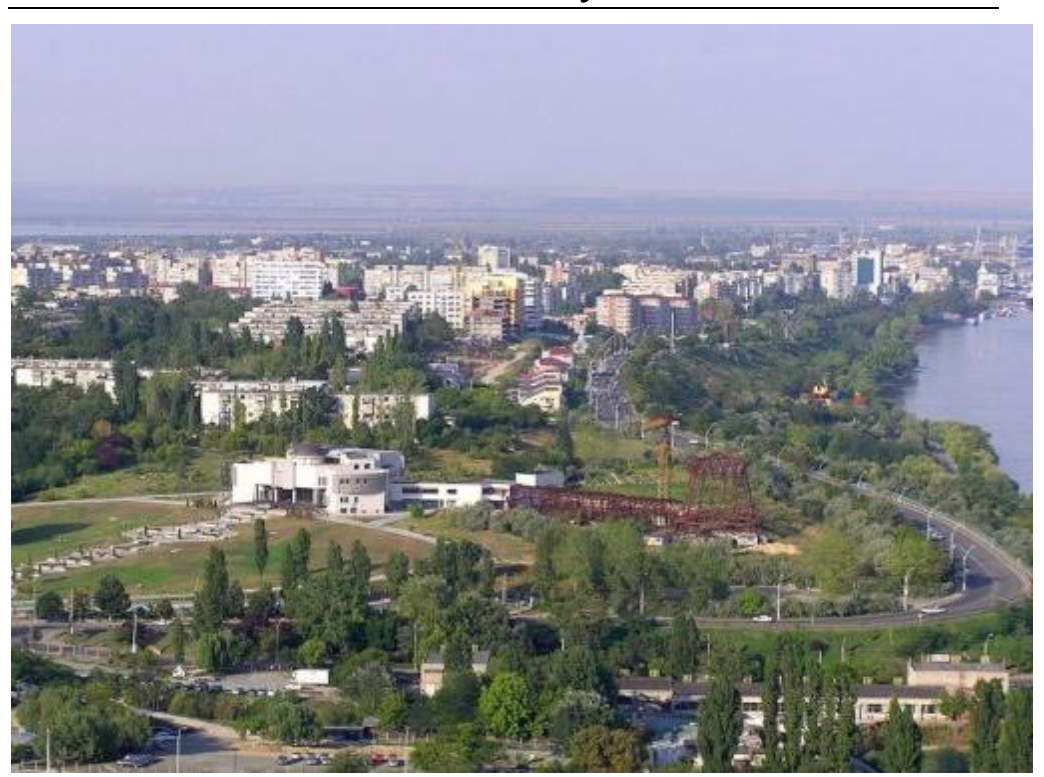
Figure 3. The area "Curve to the ferryboat"<sup>1</sup>]