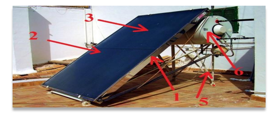
Figure 1. Flat solar collector: 1. metal housing; 2. glass window; 3. absorbance board; 4. pipes for water; 5. water storage tank; 6. metal skeletons for support. (http://casaverde2012.ro/panouri-solare/panouri-solare-fotovoltaice-hymon/)

From the operational point of view, the main component of the solar collector is the component that converts the energy absorber of sun thermal energy and an agent assigns a heat shield (water, antifreeze). Using this agent, thermal energy is taken from the manifold and is stored, be used directly, an example is the consumption of hot water.