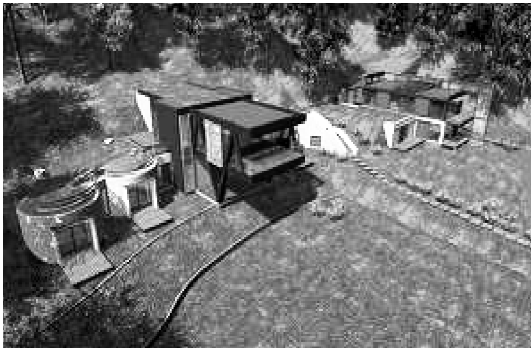
Figure 3. Multiple eco-house and a complex of relaxation 7

The heating system has integrated in the floor of a heating system, which ensures a high thermal comfort, even in areas where floor is covered with natural stones, material known like a cold floor. House subpoenaed again is semi-buried and shall provide natural thermal insulations by the thermal mass, which leads to minimize the need for energy consumption in both cold weather and the warm season. The eco-complex has not air conditioner system. This habitat has natural ventilation in summer, supplemented by a system of piping that was set on the ground, what is an inflow of cold air during the summer period and complement the solutions to air conditioning.