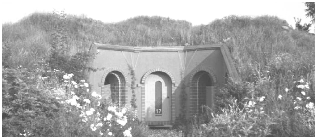
Figure 2. Ecological habitat inside and in harmonize with of landscape 6

The cost of such ecological habitat is about 330 euro on square meter.