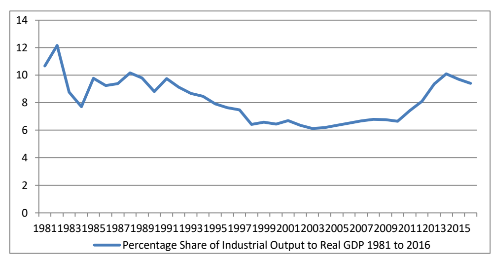
Figure 1. Percentage Share of Industrial Output to Real GDP

The lack or perhaps shortage in investment (finance) has been observed as a long standing impediment to the growth of industrial sector. The insufficient level of government investment in the sector have further put a limit to the extent to which government can provide the required output-enhancing facilities to promote the industrial sector. Recognizing the impediment posed by the lack of investment and the pressing need to fill this gap and stimulate long term industrial growth, have largely resulted in embracing foreign capital inflows as an injection into the investment stream of the country to propel industrial growth by complementing domestic savings. Besides, foreign direct investment provides access to modern technology and managerial skills, which are pertinent to the growth of the industrial sector. (Over, 1975)