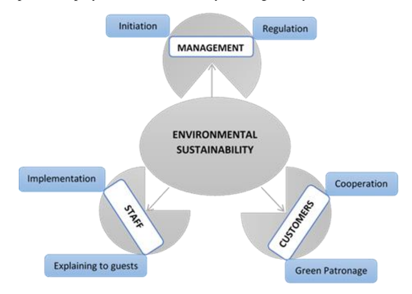
Figure 2. Responsibility for Environmental Sustainability within TAEs

To further understand the applicability of sustainability to the industry, and to identify specific actionable areas for intervention, participants were asked who they thought should be responsible for Sustainability. Emphasis was placed on the role of the management, staff and guests in implementing sustainable practices within establishments in the industry. More than half of participants were of the view that all stakeholders were responsible for the success of most sustainability initiatives. The themes identified for individual stakeholders are depicted in Figure 2. This figure indicates that management is expected to play more of an initiatory and regulatory role.