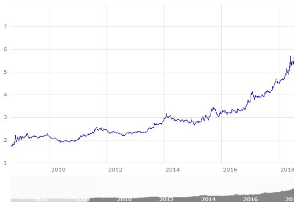
Figure 2. ECB Euro Reference Exchange Rate: Turkish Lira (TRY) (August 2008-August 2018)

In addition to this, the value of Turkish lira depreciated rapidly against dollar, euro, pound and other currencies in very recent time; and considering the EU countries, 1€ was below 2₺ in 2008, and the highest value of 1€ was recorded as more than 8₺ in August 2018, which means more than 300% increase within 10 years, hence ricocheting the purchasing power of EU citizens in Turkey, despite considerable inflation in price levels, and consecutive tax additions for certain products such as alcoholic beverages, cigarettes, and so forth. The unstoppable devaluation of Turkish lira can be seen in Figure 2.