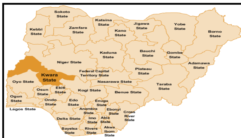
Figure 2. Map of Nigeria Showing Kwara State

The data for this study was obtained mainly from two sources primary and secondary data. Data on household level was collected for the study. The primary data was collected with the aid of questionnaire administered to households. Supporting literatures were also collected from books, journals, articles, term papers, internet browsing and other documented reports. The state is divided into sixteen LGAs, out of which 4 LGAs which are Asa, Moro, Ekiti, and Oyun were randomly selected from which, 5 communities were also randomly selected to give 20 communities. Finally, 8 respondents were selected per community to make a total of 160 respondents.